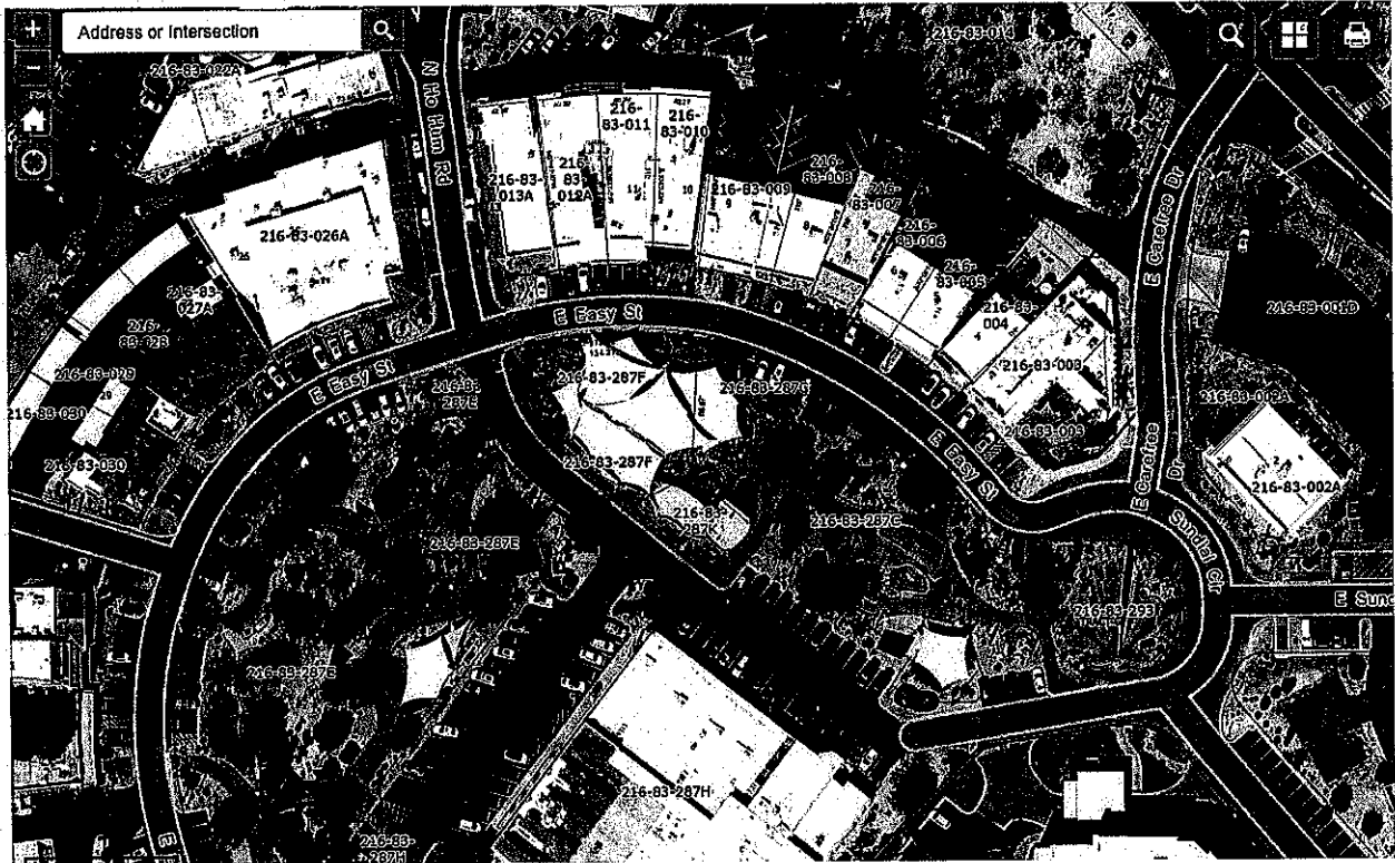
Image above depicts Town of Carefree street closure (highlighted in red)